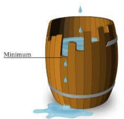
Figure 1: Liebig's Barrel

Liebig law was explained by Dobeneck in his own thoughts by an example called " Liebig's barrel "(figure 1), in this barrel the capacity to sustain water is limited by the shortest staves similar to the growth regulation by most limiting nutrients.